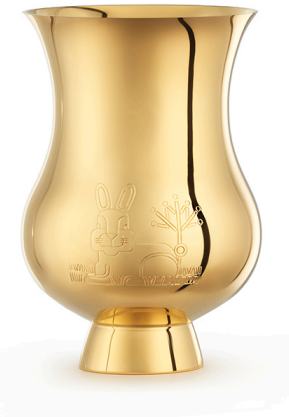
Rabbit tumbler 4027910 sterling silver 4027920 gold gilt