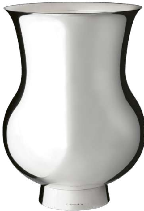
seau à champagne champagne bucket

Ø 21,5 x H. 29,5 cm | 600 cl Ø 8.5 x H. 12 in | 211 fl oz