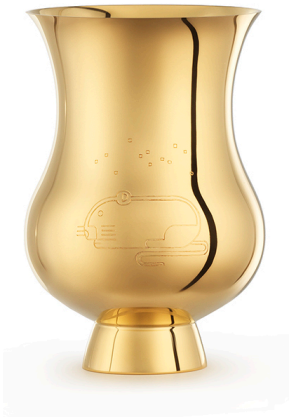
Rat tumbler 4027610 sterling silver 4027620 gold gilt