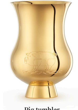
Pig tumbler 4028710 sterling silver 4028720 gold gilt

Ø 6,5 x H. 10 cm | 30 cl Ø 2.6 x H. 3.9 in | 10.6 fl oz