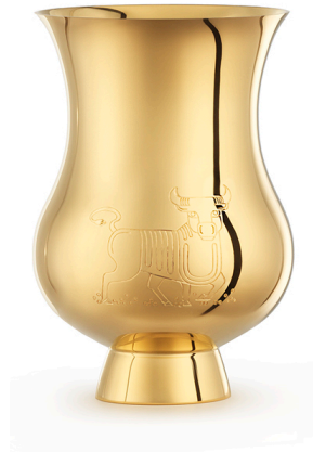
Ox tumbler 4027710 sterling silver 4027720 gold gilt