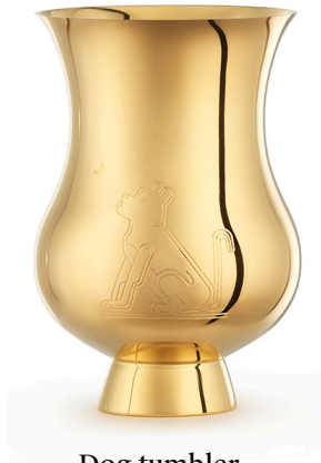
Dog tumbler 4028610 sterling silver 4028620 gold gilt