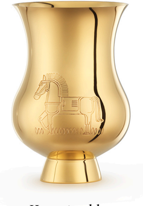
Horse tumbler 4028210 sterling silver 4028220 gold gilt