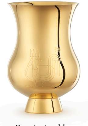
Rooster tumbler 4028510 sterling silver 4028520 gold gilt