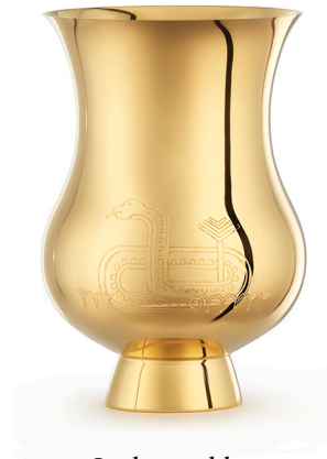
Snake tumbler 4028110 sterling silver 4028120 gold gilt