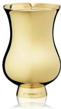
timbale vermeil gold-gilted tumbler

Ø 6,5 x H. 10 cm | 30 cl Ø 2.6 x H. 3.9 in | 10.6 fl oz