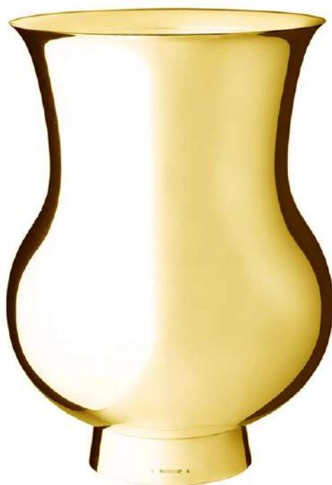
seau à champagne vermeil Gold-gilted champagne bucket

Ø 21,5 x H. 29,5 cm | 600 cl Ø 8.5 x H. 12 in | 211 fl oz