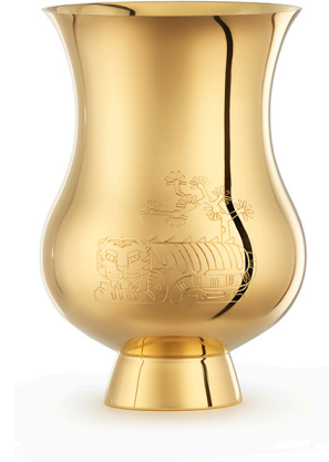
Tiger tumbler 4027810 sterling silver 4027820 gold gilt