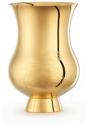
Dragon tumbler 4028010 sterling silver 4028020 gold gilt