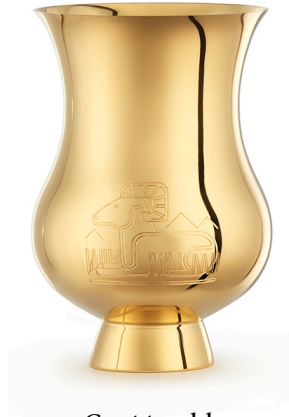
Goat tumbler 4028310 sterling silver 4028320 gold gilt