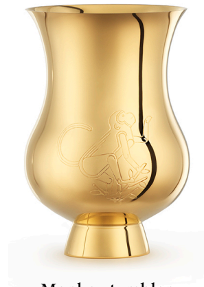
Monkey tumbler 4028410 sterling silver 4028420 gold gilt